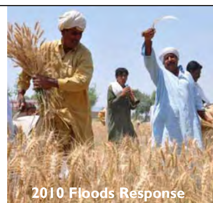
2010 Floods Response

Presence: FAO has strengthened its presence and partnerships in Pakistan, with a national office in Islamabad and provincial coordination offices in Peshawar (Khyber Pakhtunkhwa), Multan (Punjab), Hyderabad (southern Sindh) and Sukkur (northern Sindh), with presence in Quetta (Balochistan).